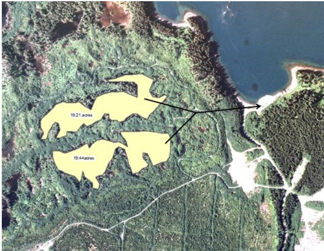
Figure 3. Location and area of the Sawmill Cove Ponds.

The ponds located to the south west of Sawmill Cove (figure 3) are considerably larger than those at the YKI site. If your project was granted access to utilize water within the ponds they could potentially provide an additional water source. I generated tables of storage and depletion rates (tables 4 and 5) using similar methods and assumptions as used to generate tables at the YKI sites.