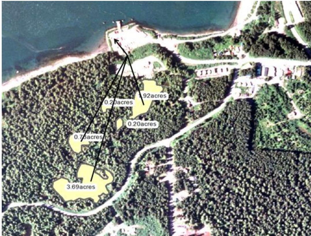
Figure 1. Showing the ponds above the proposed YKI cold storage site and their computed areas.

to discharge, the drainage area would have to be increased by a factor of four to supply an annual average discharge of 200 gallons/min. This includes the assumption that all of the rainfall could be fully utilized for hatchery operations.